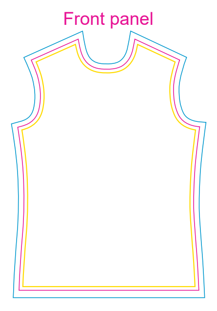
Shown at 10% actual size Print size: 493.7mm(w) x 681.6mm(h)